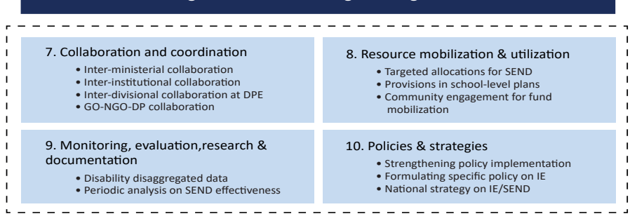
Figure 2: Domains of SEND Framework